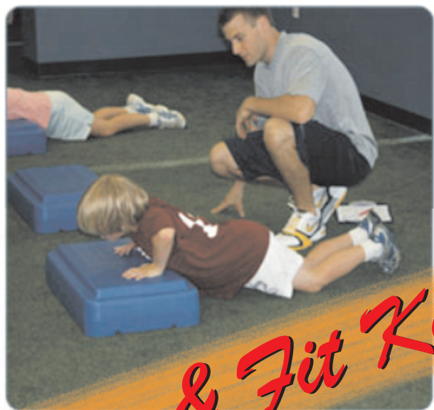
Lean & Fit Kids